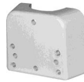
Front Clamping Block