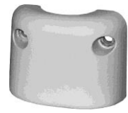
Back Clamping Block

Tools Required: Phillips screwdriver (not provided).